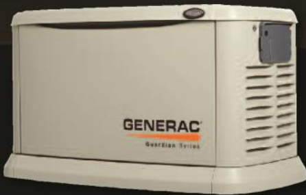
Automatic Standby Generator