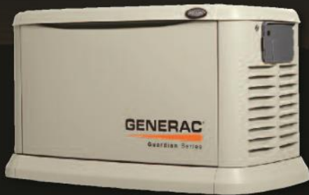
Automatic Standby Generator