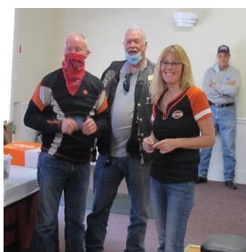
5 year members