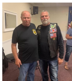
Our new Road Captains