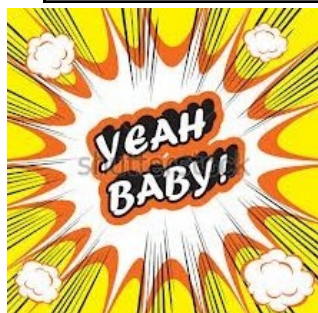
Dom Mozzone 2014 Ultra Classic Limited