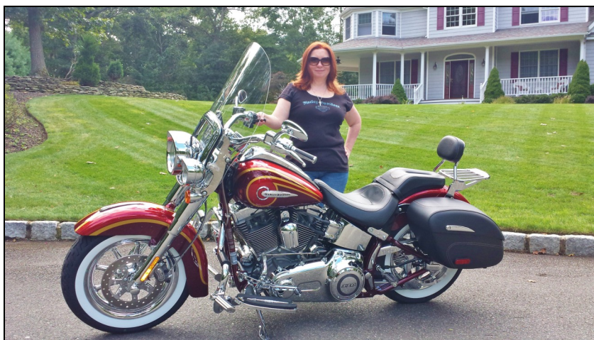
Pat Grant 2014 CVO Deluxe