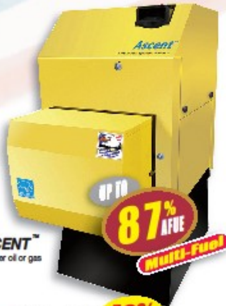
ASCENT™ Combi boiler oil or gas

Install an integrated heat and hot water hybrid system from Energy Kinetics!