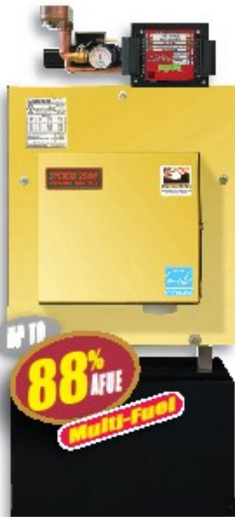
SYSTEM 2000™ Non-condensing high efficiency oil or gas