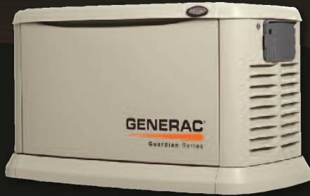
Automatic Standby Generator