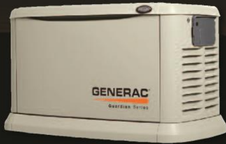
Automatic Standby Generator