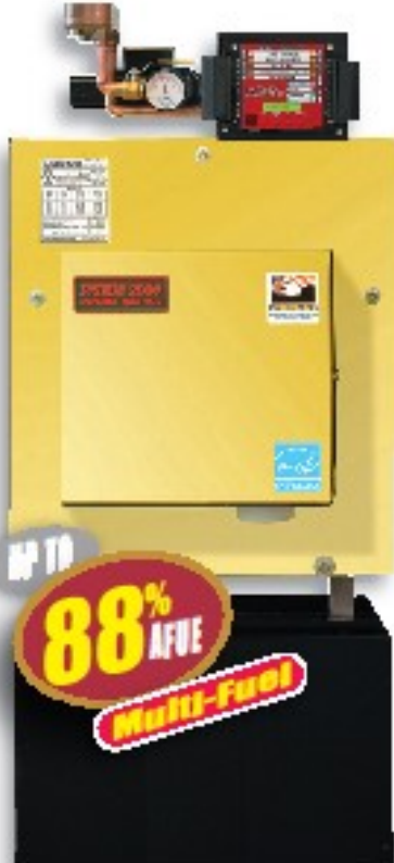
SYSTEM 2000* Non-condensing high efficiency oil or gas