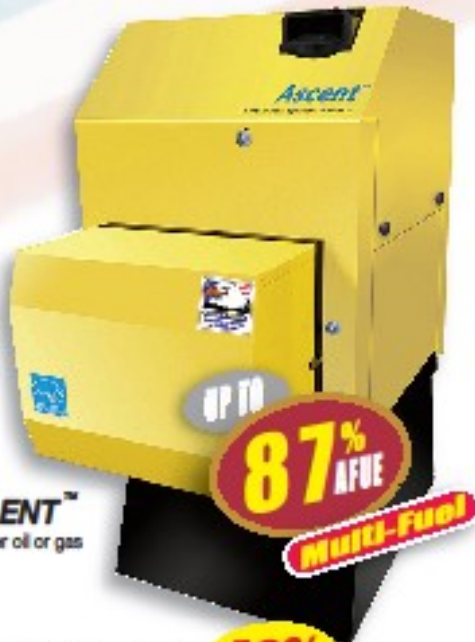
ASCENT™ Combi boiler oil or gas

Install an integrated heat and hot water hybrid system from Energy Kinetics!