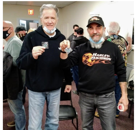
Challenge Coin Honoree's