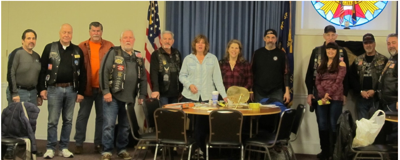
Big Thanks to our Terrific Volunteers!!!!