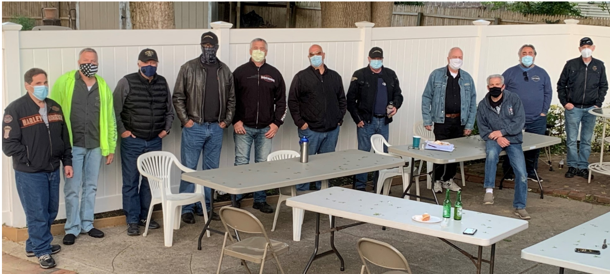
This is what our first Primary Officers meeting and RC meeting looked like with the COVID 19 Crisis! Can you name these masked men!!!!