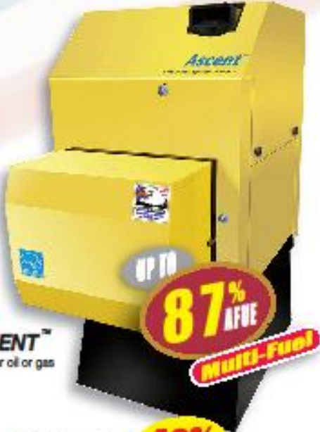
ASCENT™ Combi boiler oil or gas

Install an integrated heat and hot water hybrid system from Energy Kinetics!