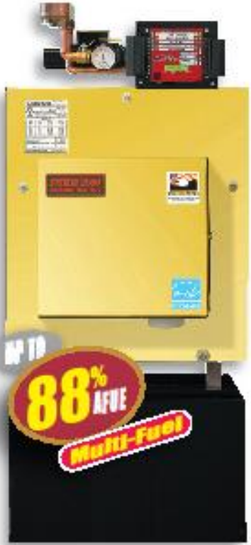
SYSTEM 2000® Non-condensing high efficiency oil or gas