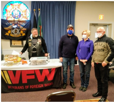
Congratulations to our 5 year members