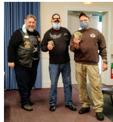
Our 50/50 winners! Thanks Guys for donating your winnings back to Sagamore Children's Hospital