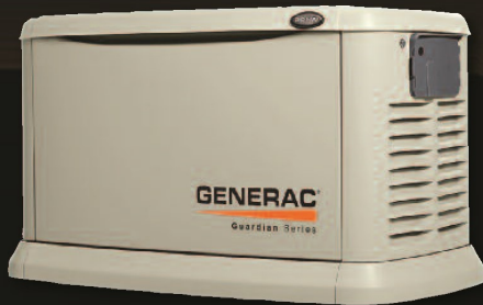
Automatic Standby Generator