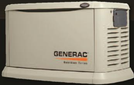
Automatic Standby Generator