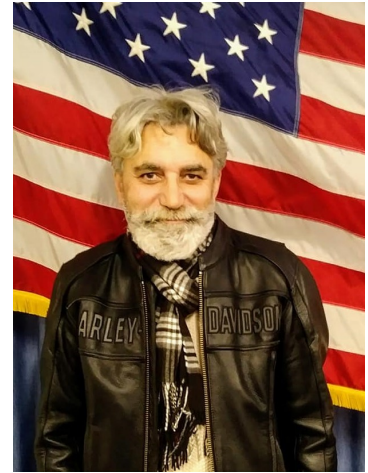
Hoss Alem 2000 Road King